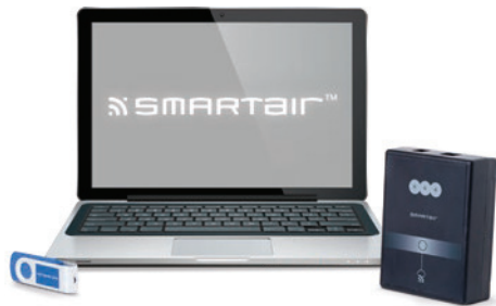
PC, software and card encoder